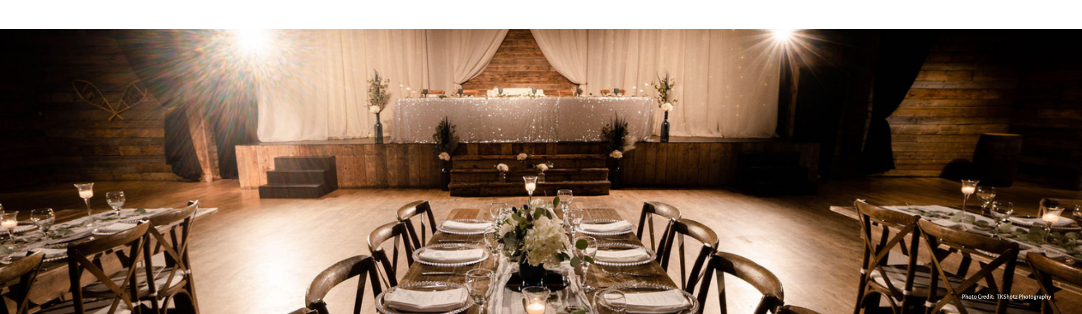
Table runners & overlays, tablecloths, slideshows, décor & stationery packages. Ask us about selections & pricing.